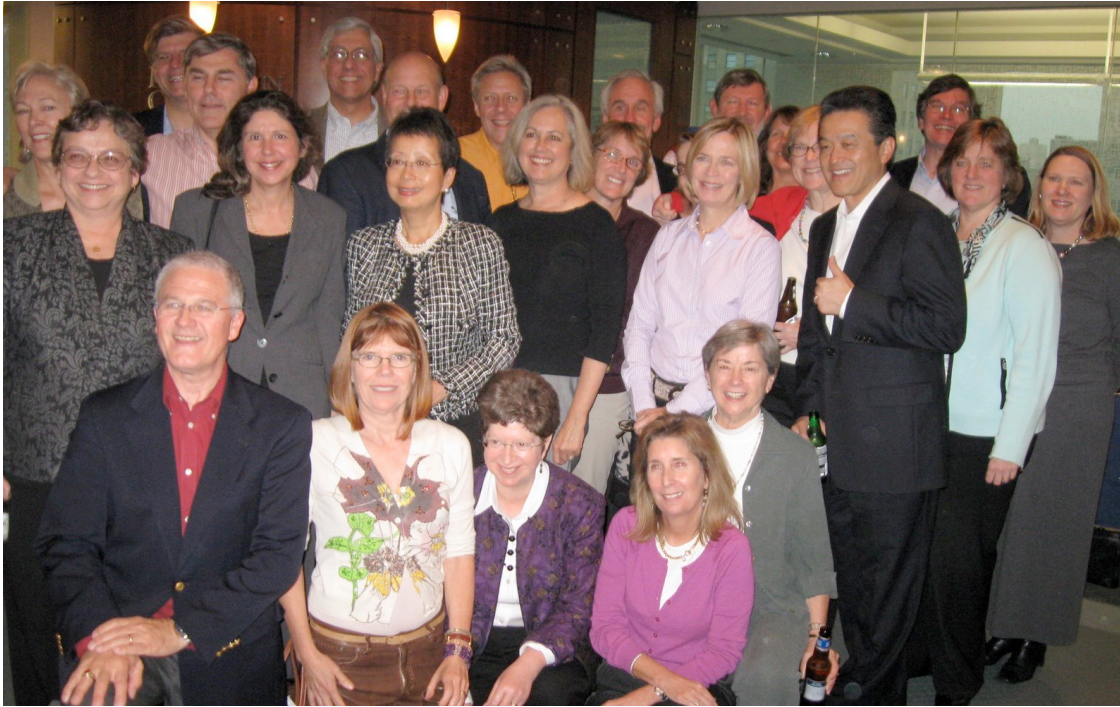
Can We Really Be Thirty Years Older? We Haven't Changed a Bit!