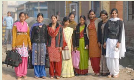
Women working for HOPE worldwide, one of the socially entrepreneurial projects funded by Project Redwood in 2009

100% of these funds came from us, members of the Class of 1980 from the Stanford Graduate School of Business. Project Redwood is one of the few non-profits that receive all financial support and volunteer efforts from a single business school class.